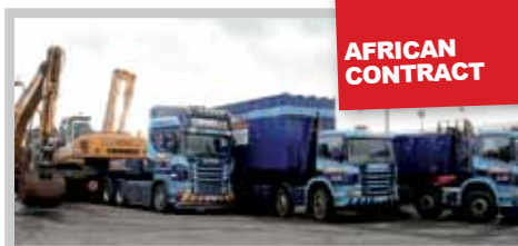
John Tinnelly & Sons plant at quayside prior to shipping to Sierra Leone.

The John Tinnelly and Sons' specialist demolition plant was shipped along with a 360 degree rotating concrete pulveriser, hydraulic rock hammer, 360 degree rotating sorting grab, digging and grading buckets to facilitate the structural demolition and site-clearance work, scheduled for completion before Christmas